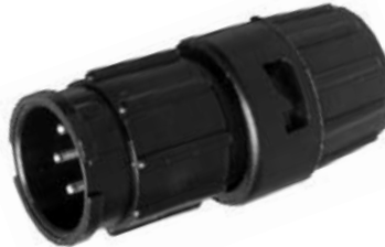
Cable to Cable 8X8X-XXB-XXX Matching Mates: • Cable Pin 6X8X-XPB-XXX • Cable Socket 6X8X-XSB-XXX