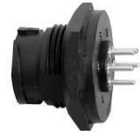
P/C Tail Panel Mount 7XXX-XXB-XXX Matching Mates: • Cable Pin 6X8X-XPB-XXX • Cable Socket 6X8X-XSB-XXX